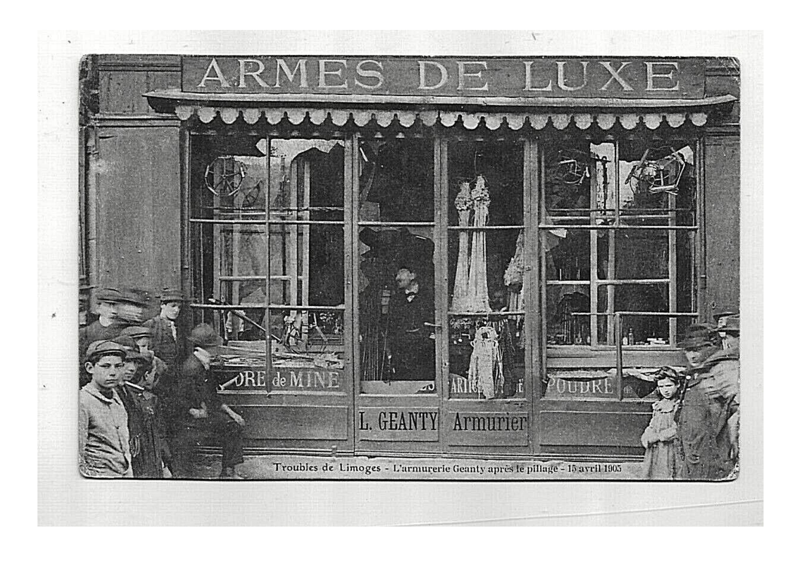
The Geanty Arms Store