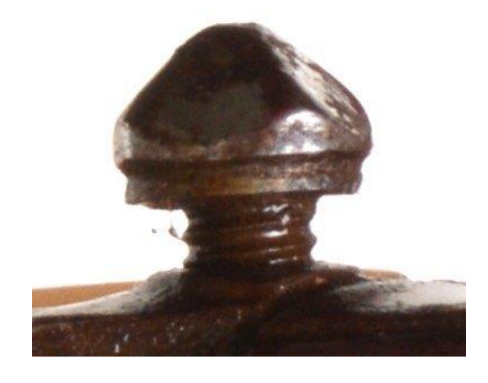
Access the chamber by removing the "thumbscrew".