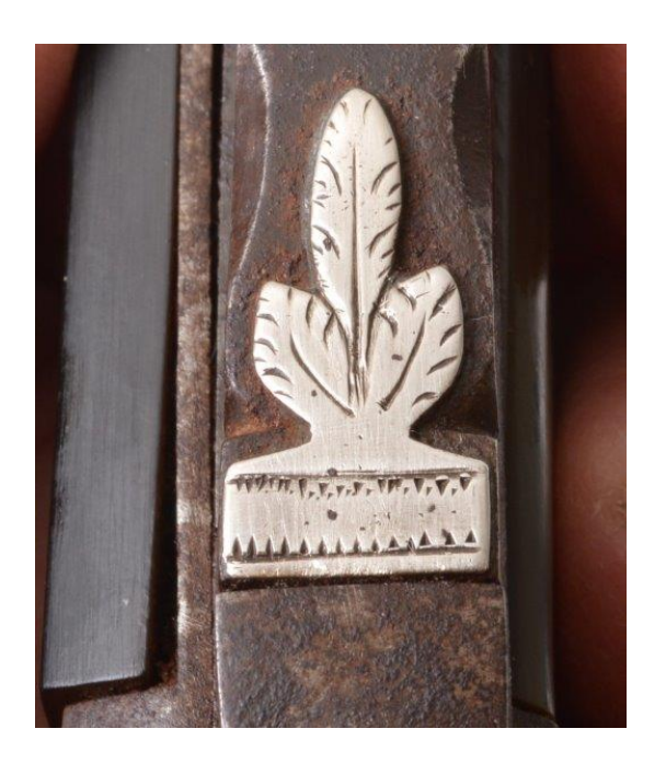
Raised set of three silver feathers (from the crest of the Prince of Wales)